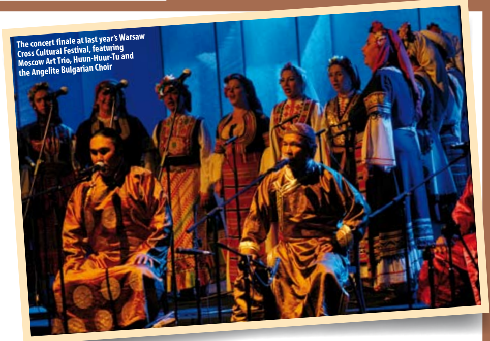
The concert finale at last year's Warsaw Cross Cultural Festival, featuring Moscow Art Trio, Huun-Huur-Tu and the Angelite Bulgarian Choir

June, Riverside Park on Czartoria Street, www.zamek.poznan.pl