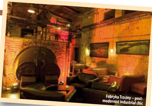
Fabryka Trzciny – post-modernist industrial chic